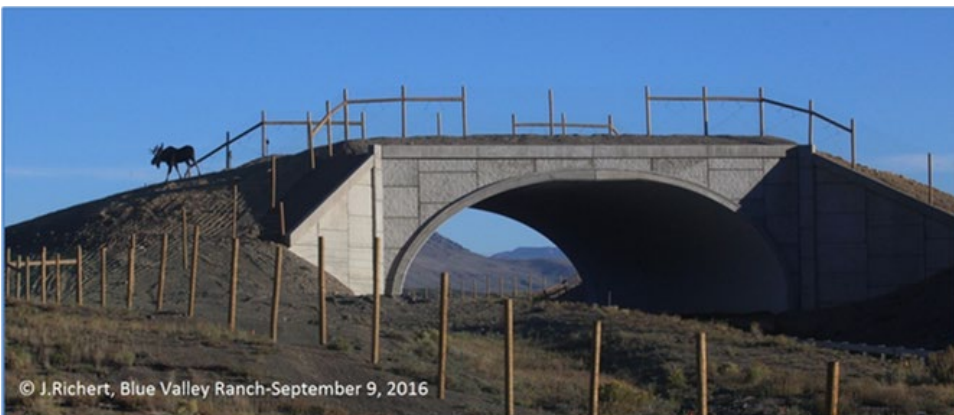
Blue Valley Ranch-September 9, 2016

Following the lunch and presentations, CDOT will be taking the group on a guided tour of Glenwood Springs' Grand Avenue Bridge construction project. The Roaring Fork Valley has felt the traffic impacts of a the full bridge closure since August 14th. The new bridge is scheduled to be opened to traffic after 95 days. Please bring your hard hat and vest.